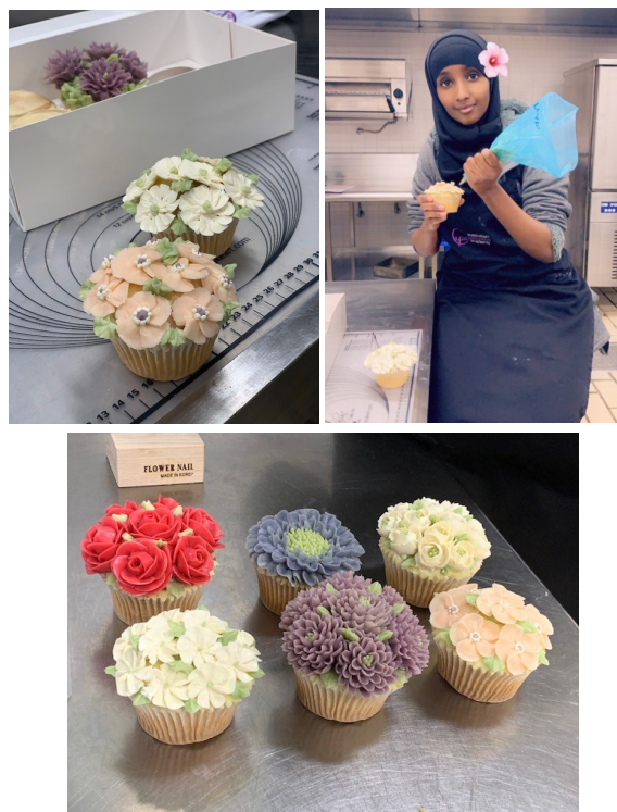
Amazing cupcake decoration by students