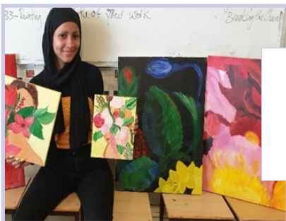
Noor Al Hashemy