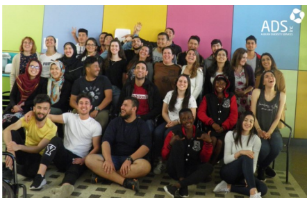
Some of BSC students who have taken part in Learn to Swim program over the past year