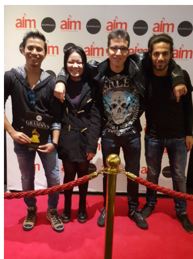
Year 12 Music Students

The year 12 students are now focussed on ensuring their music and performances will be energetic and dramatic. There is no doubt they will be performed with enthusiasm.