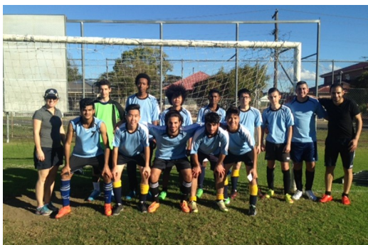
BSC Football Team

Mrs Boulet was very proud of the whole team who showed great enthusiasm high energy and dedication as they represented the college.