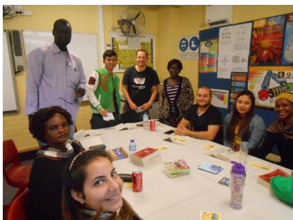
Students at the Bible Group

The college has a number of clubs and discussion groups that meet regularly. This allows students to extend their social groups and build on their interests. Groups include Girls Yoga, Table tennis, Gym, Board Games, Bible Groups, Women's Group.