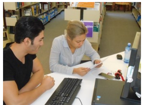
After School Assistance in Bankstown Senior College Library