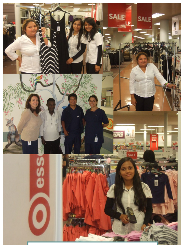
Work experience at Target