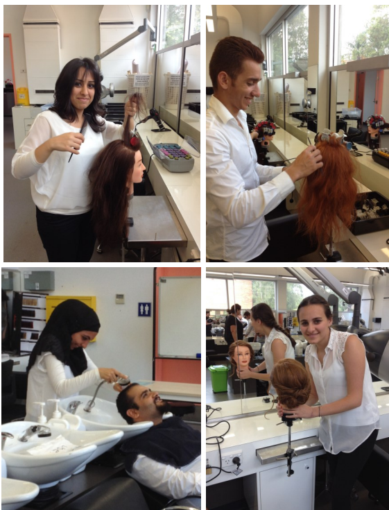
Students at the Hair & Beauty Course

Graduating students at the IEC had the chance to attend short courses at TAFE at the end of Term1. Students were able to study in Hospitality, Automotive or Hair and Beauty. It was a great chance for students to study in courses they might be interested in and a chance to experience tertiary education in Australia.