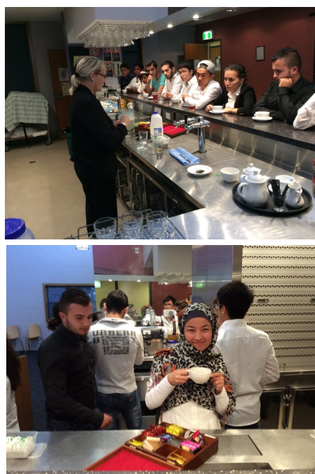
IEC Students at Barista Course