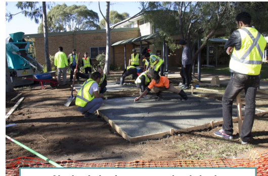
Students laying concrete slabs to re-locate the two picnic tables